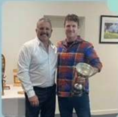
Simon P Lindsay Davey Perpetual Trophy for the Club Captains Award