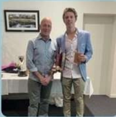
James Ben E Lovelock Perpetual Trophy for Best U19 Club Member