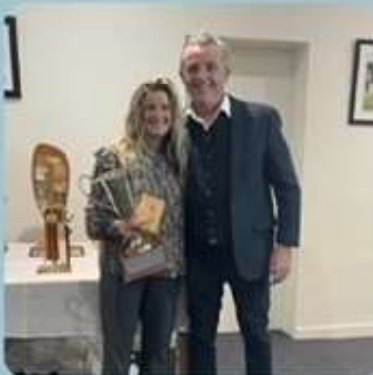
Jill Presidents Trophy