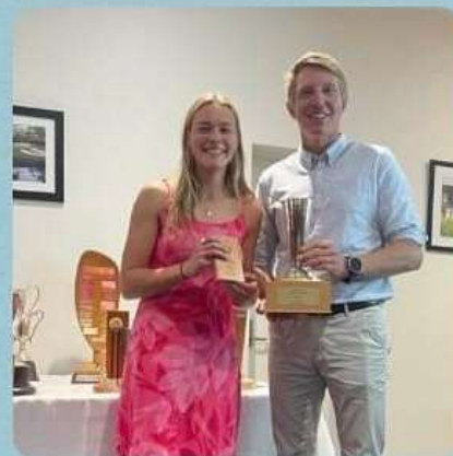
Cate NW Mills Perpetual Trophy for Best U19 in Competition