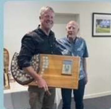
Craig Foundations Members Trophy