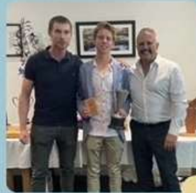
James LM Pichford Memorial Trophy for Best Patrolling Member