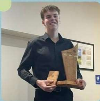
Oliver Coaches Award