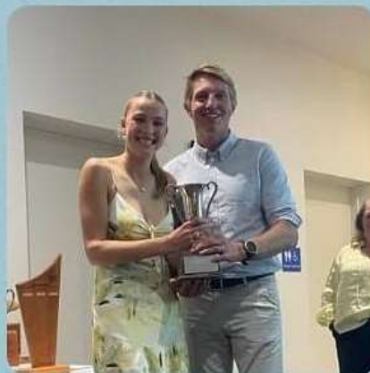
Natalie Siman Kay Perpetual Trophy for Best U17 in Competition